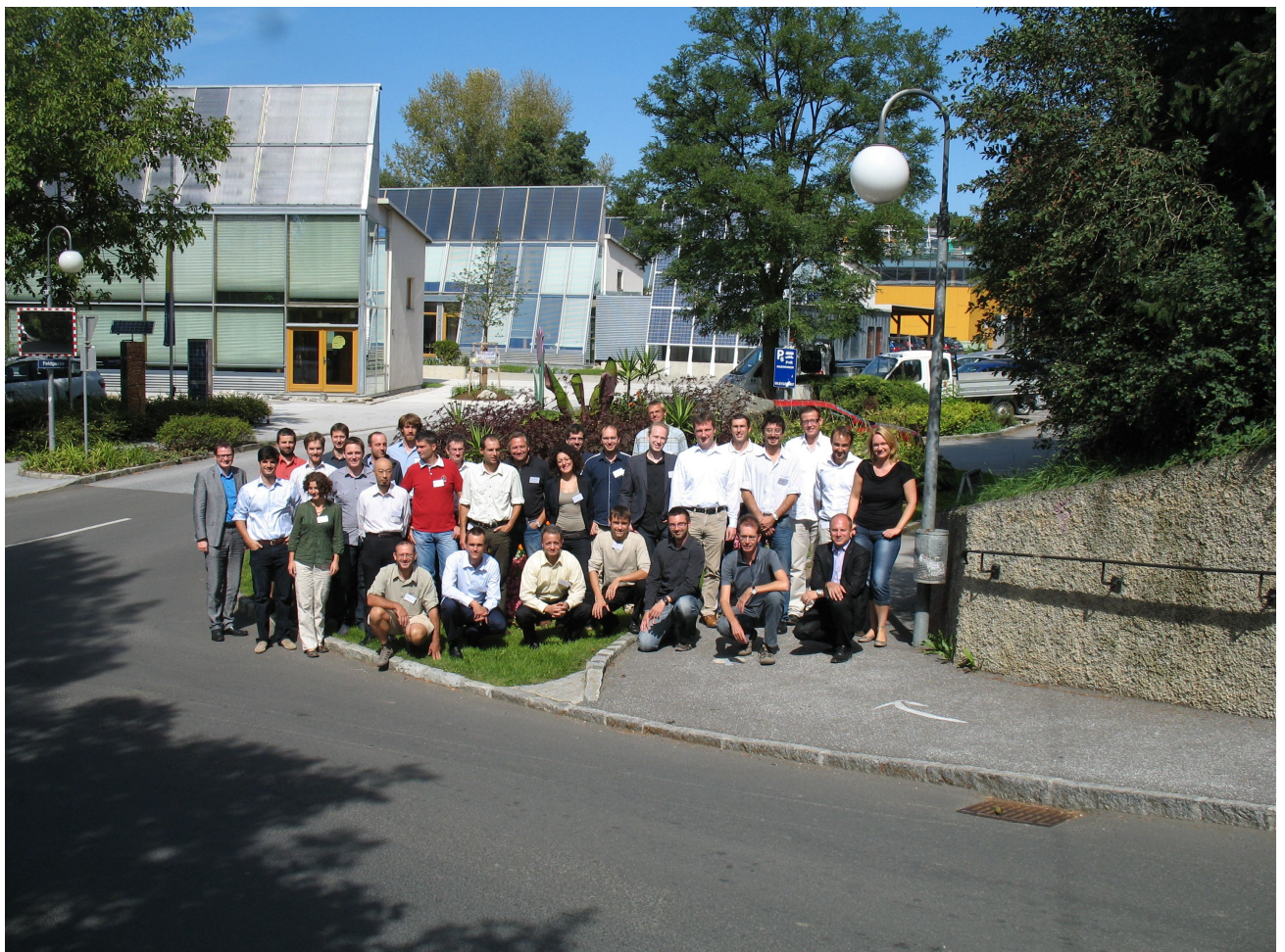
Picture of the 3 rd Task 48 expert participant

The registred participants and attending participants of the 3 rd expert meeting are listed in Table A1 & A2 in Appendix A.