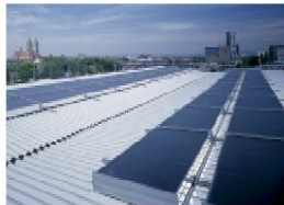
Solar cooling installation using DEC technology and air collectors in Central Europe