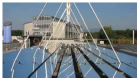
Fresnel collector field adapted for solar cooling