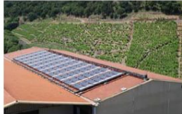
Solar cooling installation for a wine cellar in South of France