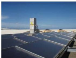
Solar cooling installation for a Tertiary building in Tropical climate